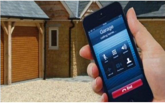
Mobile phone blue tooth receiver