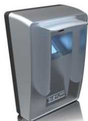
Finger print reader