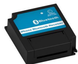
IPHONE blue tooth