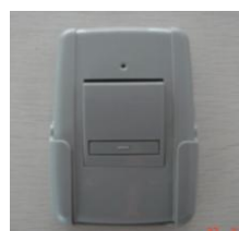
wireless wall switch